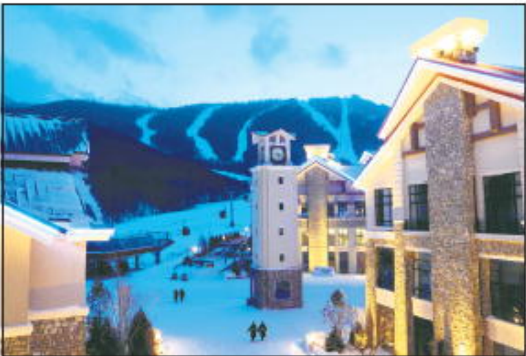
Enjoy the cool climate at Club Med Yabuli in Heilongjiang province in China when the upmarket snow resort opens in November.