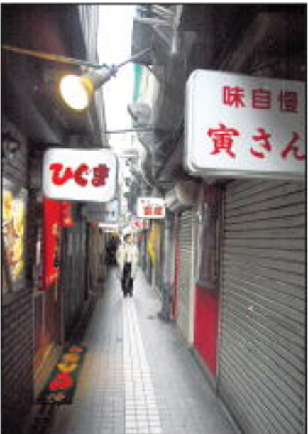
If looking at real seafood frozen into the ice at the Susukino Ice Festival leaves you cold, hop over to Ramen Yokocho (above) for warm noodles.