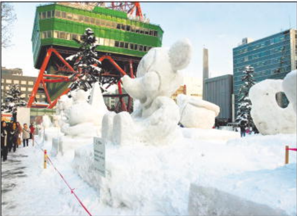
Whimsical figures populate the Sapporo Snow Festival (above) and Otaru Snow Gleaming Festival (right).

As the plane flew farther north into the Tohoku region, the ground got progressively whiter. Across the sea Hokkaido loomed as a cleansed body offering itself as a winter wonderland. White banks piled high beside the railway line from Chitose airport to the centre of Sapporo, Hokkaido. I knew I had arrived at the snow festival. The event started when a bunch of bored school kids in 1950 decided to build a series of snow sculptures in the central Odori Park. Their optimism amid the hardships of post-World War