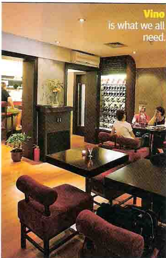
Vino is what we all need.