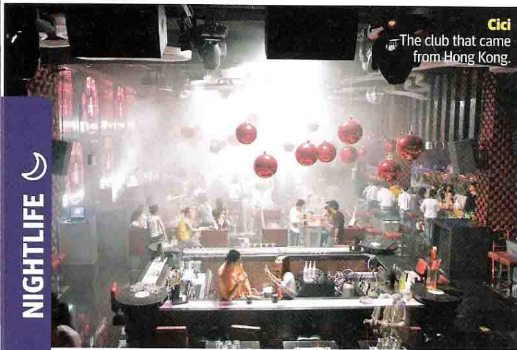
Cici The club that came from Hong Kong.