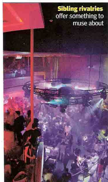
Sibling rivalries offer something to muse about