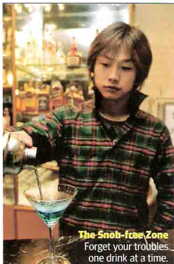
The Snob-free Zone Forget your troubles one drink at a time.

Perfect For: as a friendly local. Add: 1221 Changle Lu 长乐路1221号 Tel: 5403-5521 The Verdict: ●●●●